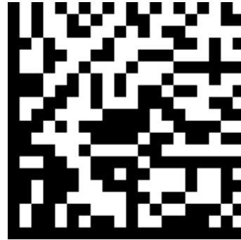
Single Scan Mode On [3]