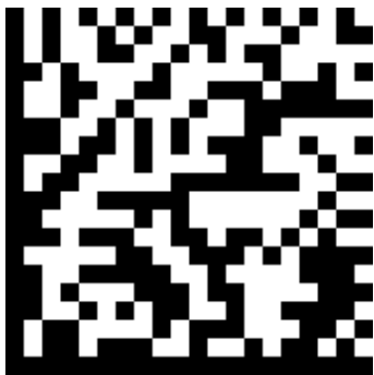
Single Scan Mode Off [2][3]